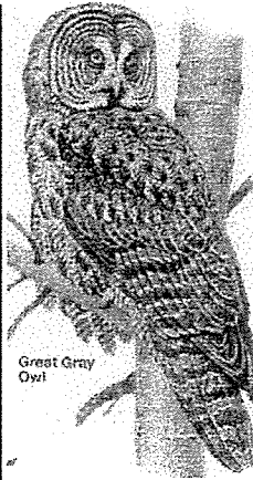
Great Gray Owl