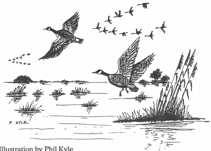
Illustration by Phil Kyle

We are in the process of revising our rare bird hotline and hope to come up with a system that is more efficient in getting out the word promptly when an unusual sighting occurs. Members who are interested in being included in the new hotline and are willing to make every effort towards making it work should sign up for it at the September meeting, or get in touch with Mark Tuttle, Box 635, Barnstable, MA 02630 (telephone 362-3015) by no later than September 20. Please sign up again even if you have been on the hotline this past year.