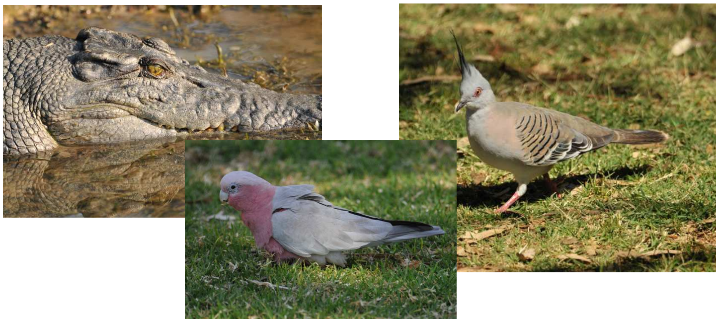
Photos: Saltwater Crocodile, Galah, Crested Pigeon

It is difficult to summarize a place so vast and so variable. I suggest that you Google everything you can about Darwin, Kakadu, The Great Red Center, Alice Springs, the MacDonnell Ranges.... and then start on the birds. This part of Australia is much less visited than the coastal cities to the east but offers great rewards for the World War II buff and the naturalist. There are Rainbow Pittas, Hooded parrots, Purple-crowned Fairywrens, and the stunning Gouldian Finch waiting for you. Oh, yes, and look for great huge termite mounds and aboriginal petroglyphs, and then seek out a good cold beer (VB, Victoria Bitter, is my recommendation—they don't sell Foster's in Australia as far as I have seen.)