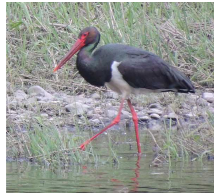
from Germany, Czech Republic and Poland (clockwise from upper left): Common Merganser, European Nuthatch, Fieldfare, Black Stork, Mandarin, and Common Wood Pigeon