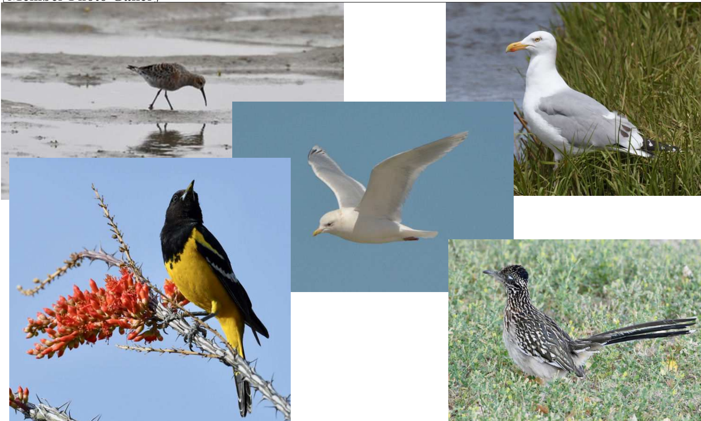
from Texas (Scott's Oriole & Greater Roadrunner) and Cape Cod (Curlew Sandpiper, Herring Gull, Iceland Gull)