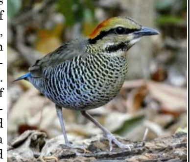
Blue Pitta, Nui Hide, 21 Feb 2020, photo by Neal Miller