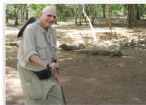
Komodo Island, Indonesia Jan