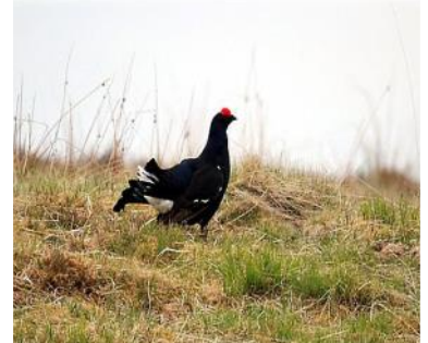
Black Grouse

Quite different are the Black Grouse . The lekking grounds of Black Grouse are accessible only when accompanied by a ranger and you need to go early in the morning to see the show. By late May, when we were there, the females were on their eggs, but some males still turned up each day to stand around – just in case – and to show off their plumage. This is a bird that you must see to appreciate fully; pictures in books just do not do it justice. Perhaps it is the absolute blackness of the glossy plumage that brings out the intensity of its other two colors. The white is the brightest and the red the most vivid imaginable. If you are lucky enough to see one display, the effect is even more striking.