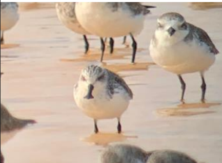
Spoon-billed Sandpiper, Pak Thale, 21 Feb 2020

We look forward to the days when these experiences are once again possible.