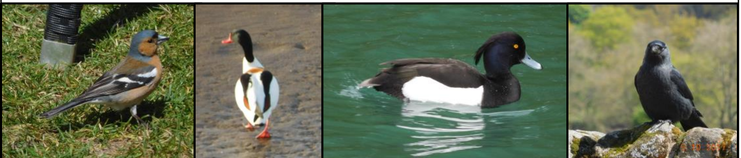
From left: Chaffinch, Shelduck, Tufted Duck, Jackdaw.

If Scotland appeals to you, check out www.birdwatchingbreaks.com .