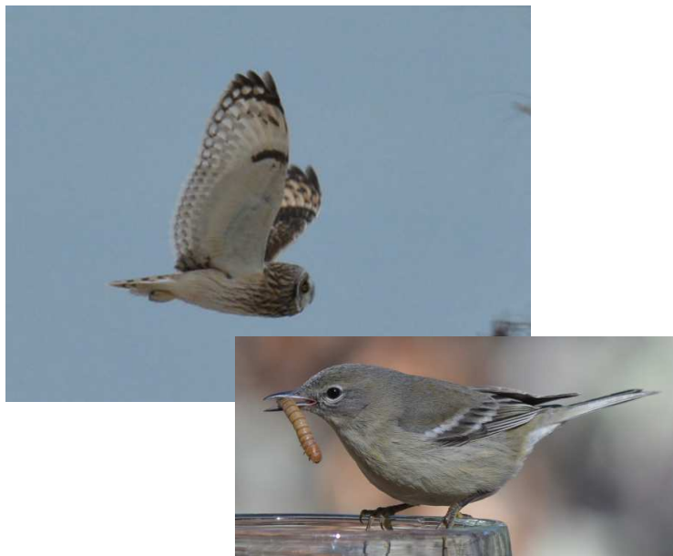
Short-eared Owl and Pine Warbler, David Clapp