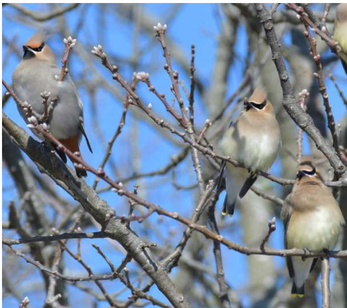
Bohemian Waxwing (left) in P'Town with Cedar Waxwings