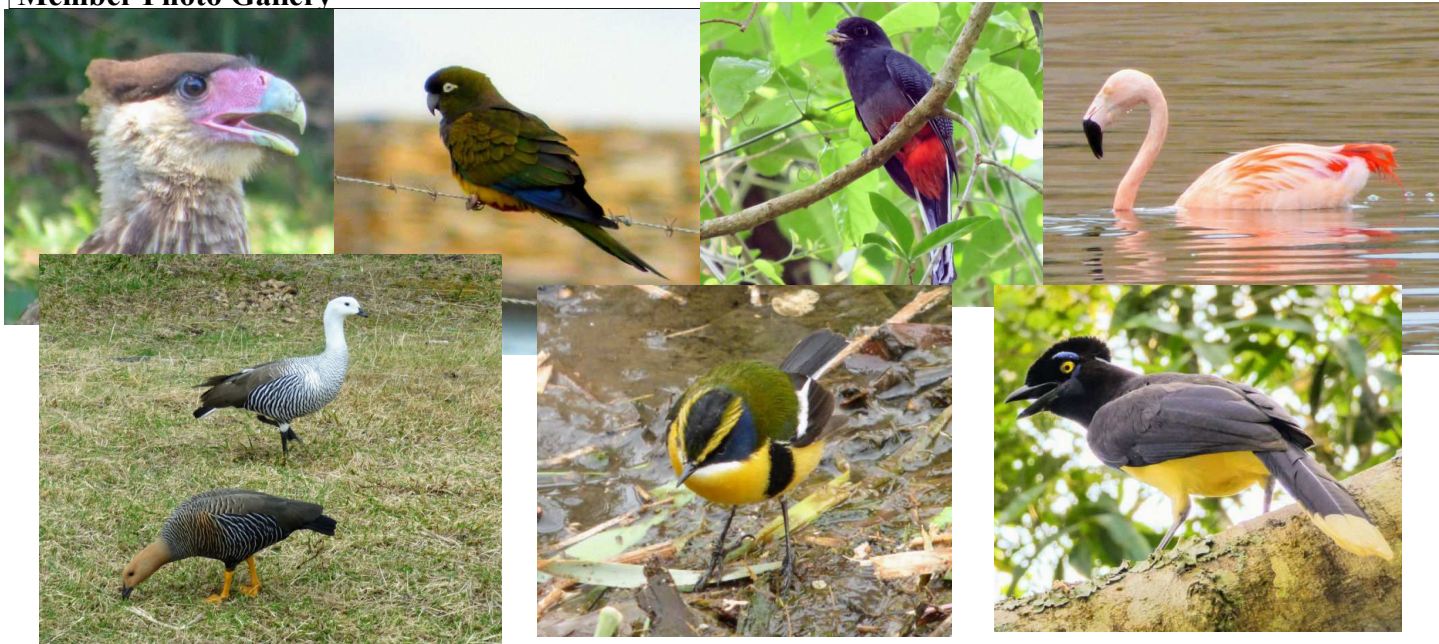
November 2019 in Argentina, Neil Miller (clockwise from upper left): Southern Crested Caracara, Burrowing Parrot, Surucua Trogon, Chilean Flamingo, Kelp Goose (male above, female below), Many-colored Rush-Tyrant, Plush-crested Jay