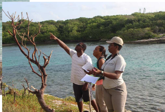
Learning to identify birds (above); Learning to record data (right).